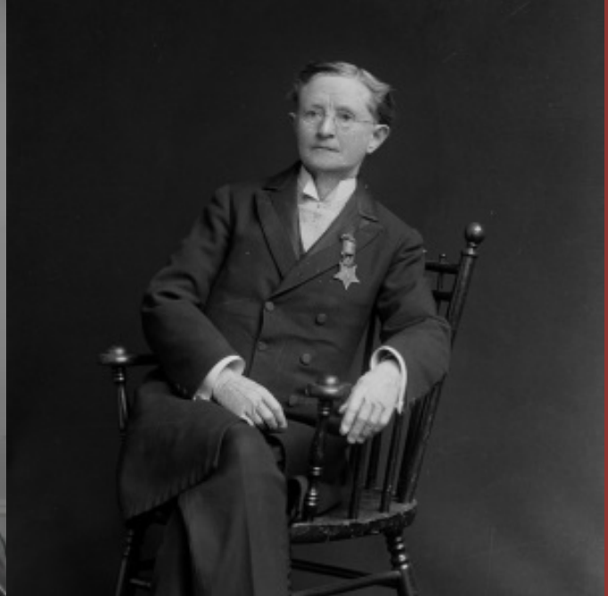
Image source: "Mary Edwards Walker," Wikipedia, The Free Encyclopedia, https://en.wikipedia.org/wiki/Mary_Edwards_Walker , accessed November 21, 2024.

Clara Barton, founder of the American Red Cross and known as the "Angel of the Battlefield" during the Civil War, was born in Massachusetts.