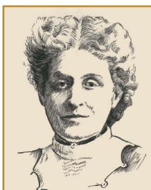
Carrie Chapman Catt

Woman suffrage activist, and Silent Sentinel who protested for suffrage at the White House