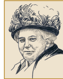
Anna Howard Shaw

Missouri suffragist who appealed to the Supreme Court for her right to vote in Minor v. Happersett (1874)