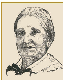
Ana Roque de Duprey

Founded a suffrage organization in Hawaii and NAWSA member