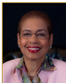
Eleanor Holmes Norton

Voting rights activist, writer and founder of Voto Latino