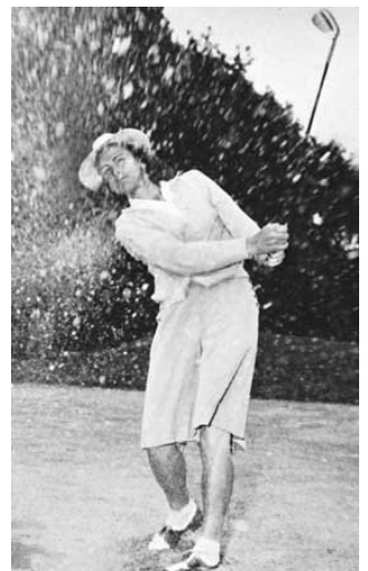
"Babe Didrikson Zaharias."

Babe Didrikson Zaharias was a remarkable American athlete who excelled in track and field, basketball, and golf. Born on June 26, 1911, in Port Arthur, Texas, she gained fame in the 1932 Olympics, winning two gold medals and one silver. She later turned to golf, becoming a founding member of the Ladies Professional Golf Association (LPGA) and winning 10 major championships. Known for her fierce competitiveness and exceptional talent, Zaharias was a trailblazer for women in sports, inspiring athletes worldwide.