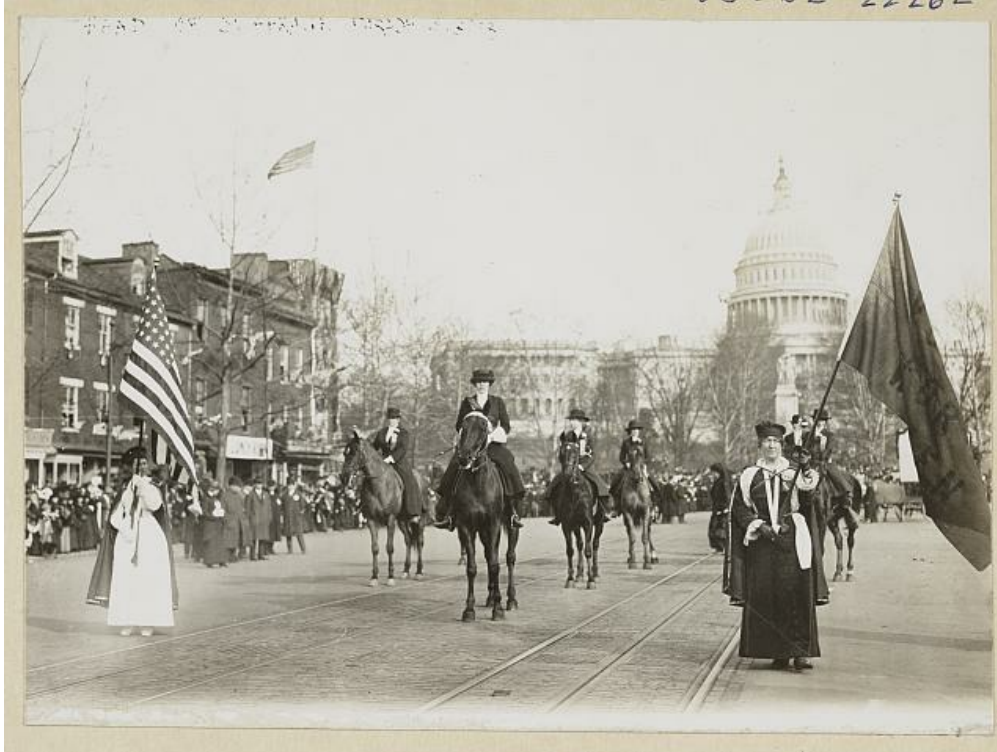
(1913) Head of suffrage parade in Washington, D.C., Mar. 3. Washington D.C, 1913. March 3. [Photograph] Retrieved from the Library of Congress, https://www.loc.gov/item/97500042/ .